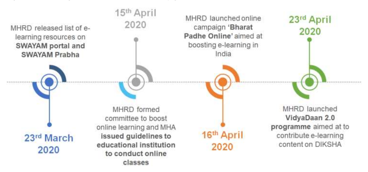
Figure 2: e-learning timeline – initiatives taken by government of India